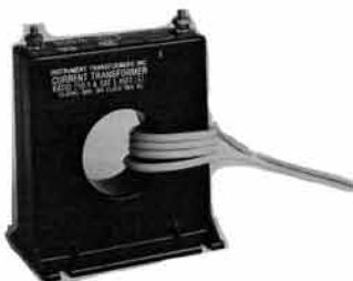
CT 150:5 with 4 Turns

For loads over 30 HP (460 Volts), a Current Transformer is used to reduce the primary current. The 5 Amp secondary passes through the Toroid (Jump Terminal 3 to 4 for 5 Amp capacity).