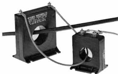
Pass Secondary Of CT Through Toroid

For most loads the CT 150:5 is used and the capacity is changed by changing the number of turns. The proper number of Turns must be used to reach the desired rating.