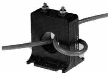
This is Two Turns