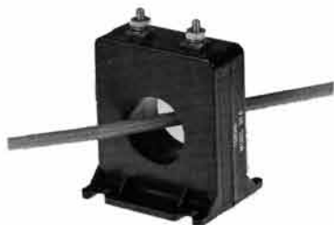
This is One Turn

The capacity (sensitivity) of the Control can be adjusted by taking more "Turns" of the leg through the Toroid. Each time the wire passes through the Toroid is a "Turn".